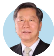
尚福林 Fulin SHANG

第十三届全国政协经济委员会主任 原中国银行业监督管理委员会党委书记、主席 中国证券监督管理委员会原党委书记、主席 中国国际跨国公司促进会特邀副会长